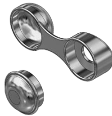
15.8 In-fill End Connector Code: J158.04