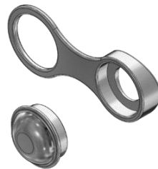
15.8 In-fill Middle Connector Code: MJ158.04