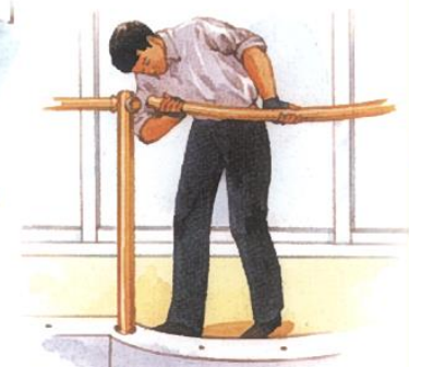
Fit Top Rail