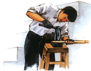
Cut Top Rail