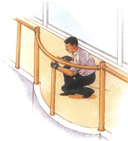
Fit Centre Post