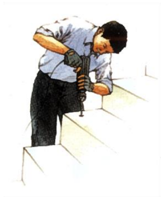
Mark & Drill