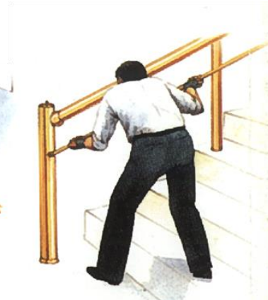
Twist in-fill to suit Stair angle