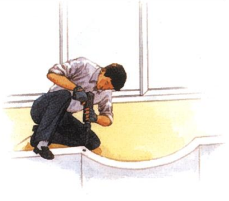
Mark & Drill